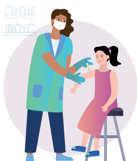
HPV vaccination of adolescents

To protect women from the devastating effects of cervical cancer, WHO calls for: