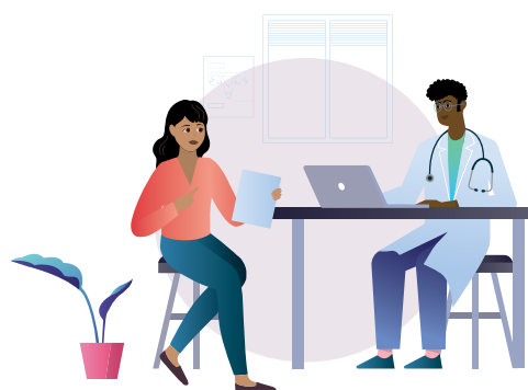
Regular screening tests for cervical cancer and quality treatment